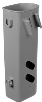
Plastic holster for polybags